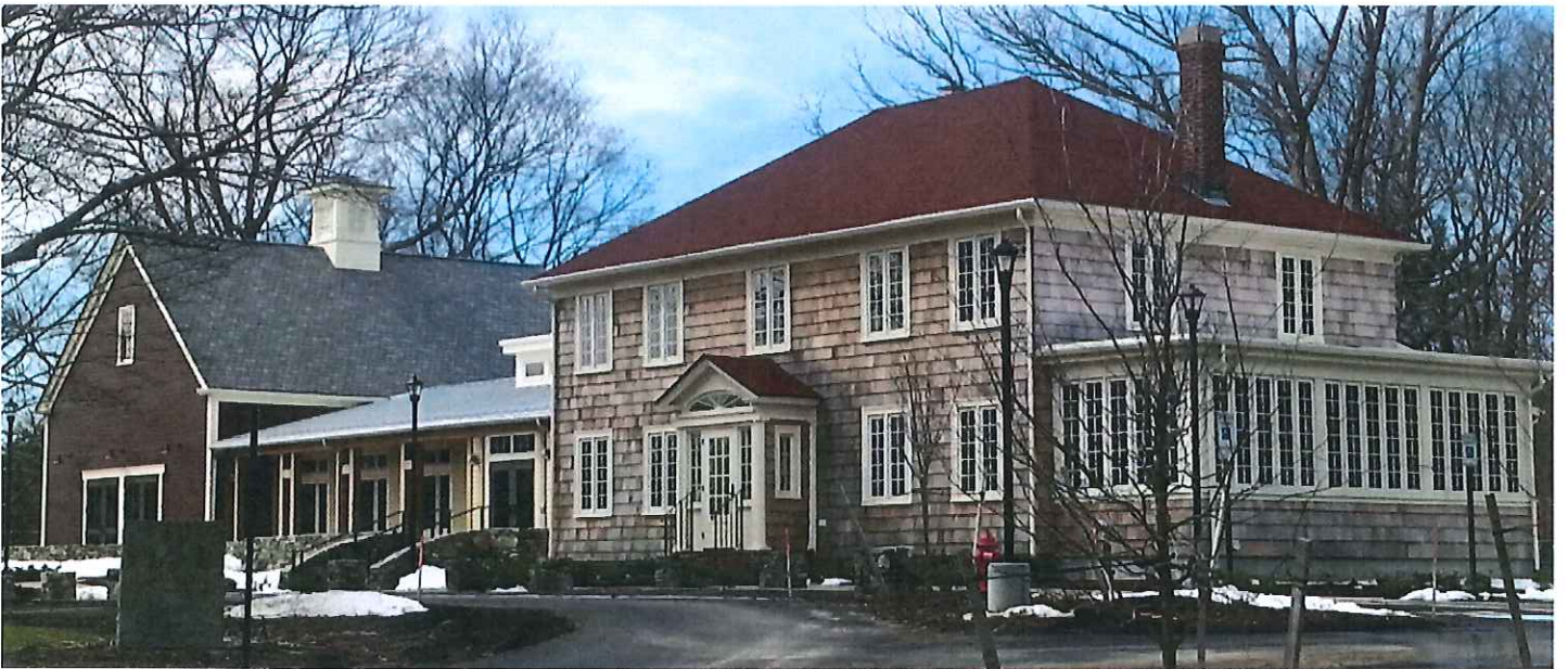
NEW COMMUNITY CENTER AT SACHEM ROCK (after)