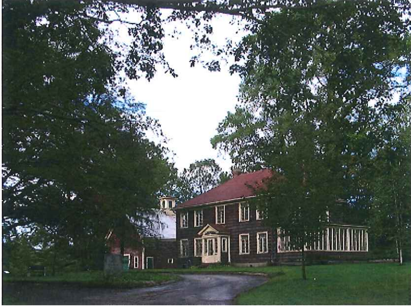
SACHEM ROCK (before)