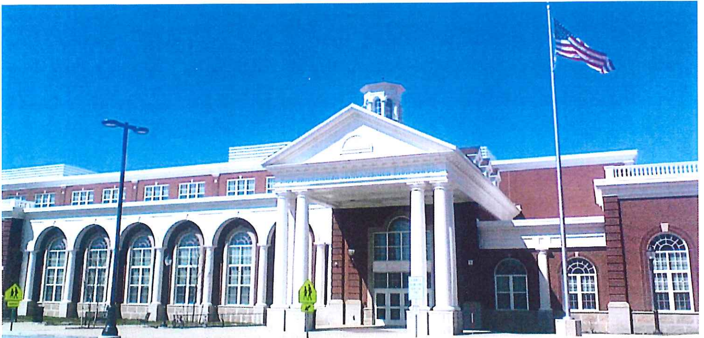
NEW JUNIOR/SENIOR HIGH SCHOOL